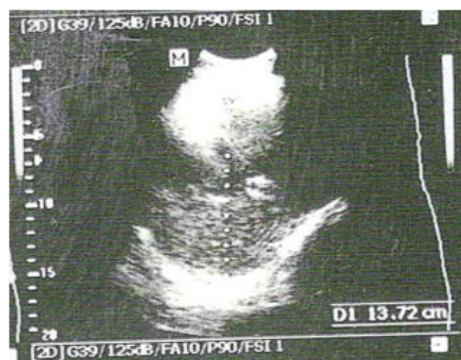
Fig. 1. Abdominal ultra-sonographic finding of a urachal cyst (longitudinal view)

An ovoid cystic lesion measuring 24 × 20 × 14 with peripheral enhancement is seen at urinary bladder's anterior wall. No solid mass is seen (Figure 2).